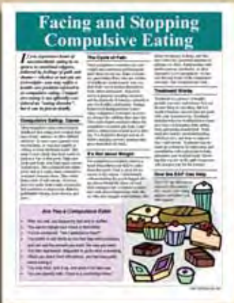
E-023 Facing and Stopping Compulsive Eating WHAT: Describes this serious health problem, symptoms, and hope for change. WHERE TO USE: Health fairs, client sessions, post-treatment follow-up.