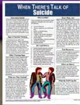
E-020 When There's Talk of Suicide WHAT: Understanding suicide facts, risks, and prevention. Dos and don'ts, taking action, helping a friend. WHERE TO USE: Counseling sessions, health fairs, waiting rooms.