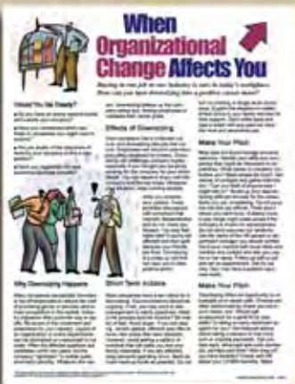
E-027 When Organizational Change Affects You WHAT: Understanding organizational change, preparing for downsizing, taking action steps, planning ahead. WHERE TO USE: Presentations, seminars, counseling sessions.

$17 each - or save $58 and buy all for $197!