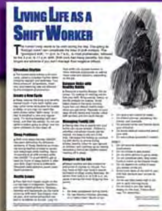
E-021 Living Life as a Shift Worker WHAT: Special issues and stressors associated with shift work and how to tackle them. WHERE TO USE: Health fairs, counseling sessions, waiting rooms, stress management presentations to shift workers.