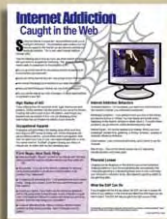
E-018 Caught in the Web of Internet Addiction WHAT: Awareness about the high risk of Internet addiction, with warning signs and more. WHERE TO USE: Health fairs, client counseling sessions, EAP waiting areas.

ALL PROGRAMS AND PRODUCTS COMPLETE WITH 100% MONEY-BACK GUARANTEE!