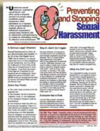
E-028 Preventing and Stopping Sexual Harassment WHAT: Sexual harassment defined, prevention steps, the importance of stopping inappropriate behavior, explaining of "no" means "no," what to do, where to go. WHERE TO USE: Presentations, client sessions, waiting rooms.