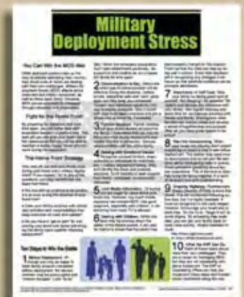
E-030 Military Deployment Stress WHAT: Helps clients deal with military-deployment stress, and provides tips on coping and remaining positive. WHERE TO USE: Health fairs, client sessions, waiting rooms.