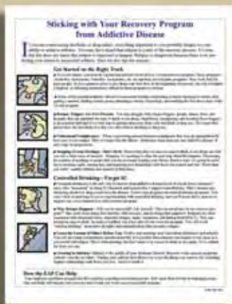
E-017 Sticking with Your Recovery Program from Addictive Disease WHAT: Essentials that every recovering addict needs to know but may take years to hear or discover in recovery. WHERE TO USE: Client counseling sessions, follow-up meetings, post-discharge back-to-work interviews.