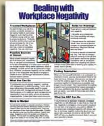
E-026 Dealing with Workplace Negativity WHAT: One of the most requested subjects. Sources of negativity and how to head it off at the pass. Some rules, some tips, and a few tricks on reducing negativity and contagion. WHERE TO USE: Brown-bag seminars, health fairs, group conflict intervention.

$17 each - or save $58 and buy all for $197!