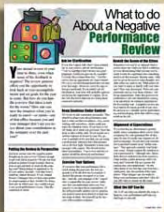
E-016 What to Do About a Negative Performance Review WHAT: Helps clients focus on the positive of a bad review, make changes, and get back to work energized and determined. WHERE TO USE: Client sessions, health fairs, EAP waiting areas, assessments.

Fact sheets come on one CD in MS Publisher, MS Word, and a PDF along with a reproducible hard copy in a top-loading sheet protector, and a plastic storage case. You can customize the fact sheets by adding your EAP name and phone number. E-mail them, create your own PDFs, or put them on a password protected Web site. Use them in waiting rooms, at health fairs, at client sessions and orientations, on bulletin boards.