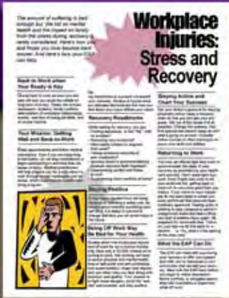
E-019 Workplace Injuries: Stress and Recovery WHAT: After injury comes the risk of depression, conflict at home and with coworkers, and risk of further injury. WHERE TO USE: Mail to clients, provide in client sessions during follow-up after injuries to help reduce workers' compensation costs.