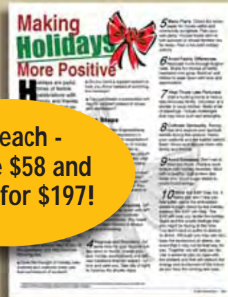
E-025 Making Holidays More Positive WHAT: A handout for those who suffer in silence. Issues, tips, getting positive, coping effectively with the holiday experience. WHERE TO USE: Client sessions and presentations, brown-bag seminars.