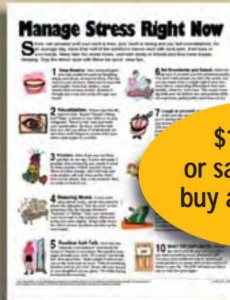
E-024 Manage Stress Right Now WHAT: Ten practical tips anyone can use to manage stress and feel rejuvenated. WHERE TO USE: Client sessions, health fairs, waiting rooms.