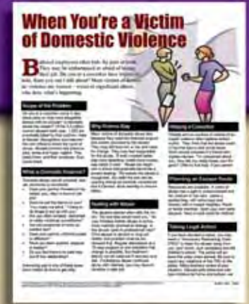
E-022 When You're a Victim of Domestic Violence WHAT: Defines domestic abuse, increases awareness, what to do. WHERE TO USE: Waiting rooms, health fairs, client sessions.