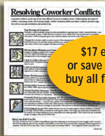
E-009 Resolving Coworker Conflicts WHAT: The nature of conflict and misconceptions. Intervention and prevention steps. How to keep relationships productive. WHERE TO USE: Conflict resolution clients, EAP direct service, workshops, EAP promotion.