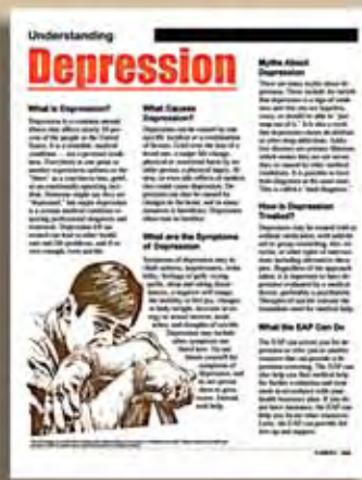
E-002 Understanding Depression WHAT: Helps employees understand depression: its causes, signs and symptoms; myths; and treatment options; and reducing stigma. WHERE TO USE: Depression screenings, EAP direct service, workshops, waiting room.