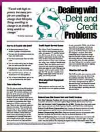
E-004 Dealing with Debt and Credit Problems WHAT: Helps employees determine whether debt trouble exists and how to take action; also tells about credit repair services and scams, and consumer laws. WHERE TO USE: EAP direct service, workshops, waiting room, promotional fairs.