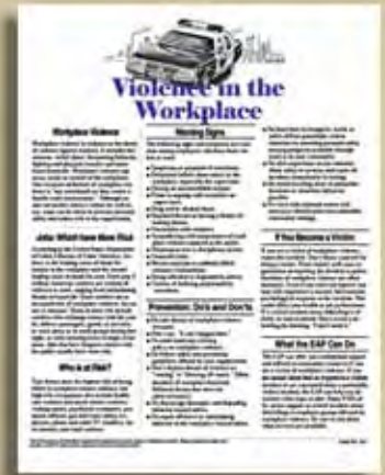
E-011 Violence in the Workplace WHAT: Defines different types of workplace violence, facts, risks, warning signs, and dos and don'ts with coworkers, and what to do if you are a victim. WHERE TO USE: Special workshops on violence in the workplace.

$17 each - or save $58 and buy all for $197!