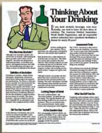
E-012 Thinking About Your Drinking WHAT: Definition of alcoholism, reducing stigma, understanding the disease, signs, symptoms, self-diagnosis, and understanding how denial works. WHERE TO USE: EAP direct service, workshops on substance abuse in the workplace.

$17 each - or save $58 and buy all for $197!