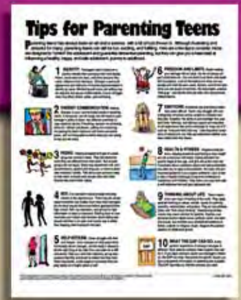
E-007 Tips for Parenting Teens WHAT: Ten tips to help parents understand key issues such as identity, self-esteem, parental conflict, peer influence, emotions, and sex. WHERE TO USE: EAP direct service, workshops, health fairs, waiting room.