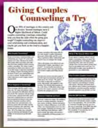
E-005 Giving Couples Counseling a Try WHAT: How couples counseling works to help save a relationship. Types of couples problems. What to do when a spouse won't go. Motivation to try it. WHERE TO USE: Direct service with EAP clients, waiting room, workshops.