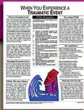
E-006 When You Experience a Traumatic Event WHAT: Understand trauma and how it affects the psyche. Traumatic stress symptoms, and dos and don'ts. About PTSD and more. WHERE TO USE: With CISM program, distribute after traumatic events.