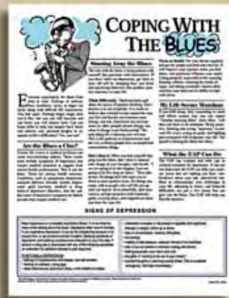
E-013 Coping with the Blues WHAT: Distinguishes normal blues from depression. Cognitive intervention to limit frequency of the blues, and when to seek professional help. WHERE TO USE: EAP direct service, waiting room, EAP promotional events.