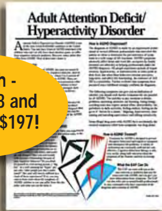
E-010 Adult Attention Deficit/Hyperactivity Disorder WHAT: Definition and description. Signs, symptoms, motivating employees to get help. WHERE TO USE: EAP direct service, EAP promotional events, waiting room.