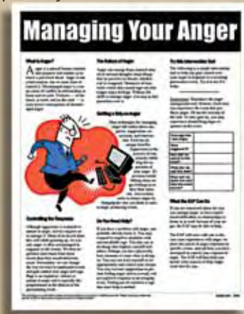
E-003 Managing Your Anger WHAT: Helps employees understand anger, gain control, and diagnose problems. Includes a tool for practicing anger management. WHERE TO USE: EAP direct service, health fairs, waiting room, workshops.

ALL PROGRAMS AND PRODUCTS COMPLETE WITH 100% MONEY-BACK GUARANTEE!