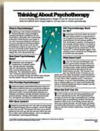
E-014 Thinking About Psychotherapy WHAT: Explains psychotherapy. Answers important questions: who, what, how, cost, managed care issues, and how to get the most from treatment. WHERE TO USE: EAP direct service, promotional events, waiting room.