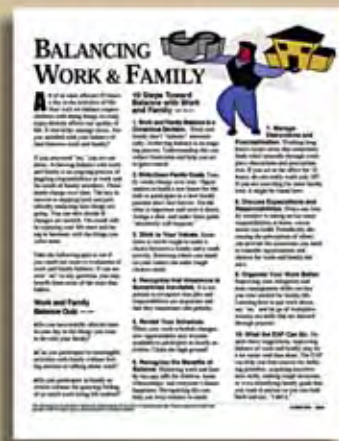
E-001 Balancing Work & Family WHAT: This handout is a practical tool to help employees understand, gain awareness of, and practice tips to improve work and family balance. WHERE TO USE: EAP direct service, workshops, waiting rooms, EAP promotion.

Choose individual titles, or get the whole set and save $58. Buy multiple sets (see other pages in this catalog) and save even more. It's like getting three free—when you purchase groups of 15. Purchase seven sets and get the 8th set free! Change the text and add your own expertise. And with exclusive editing capability available only from WorkExcel.com, you can make these valuable fact sheets fit your employee education needs perfectly.