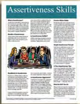
E-008 Assertiveness Skills WHAT: Defines assertiveness and why it's difficult. Benefits of being assertive. Assertiveness vs. aggression. Steps to being more assertive. WHERE TO USE: EAP direct service, health fairs, waiting room.