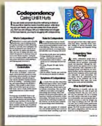
E-015 Codependency: Caring Until It Hurts WHAT: A less confusing look at codependency signs, symptoms, misconceptions, and breaking free of dysfunctional relationship behaviors. WHERE TO USE: EAP direct service, promotional events, waiting room, special workshops.